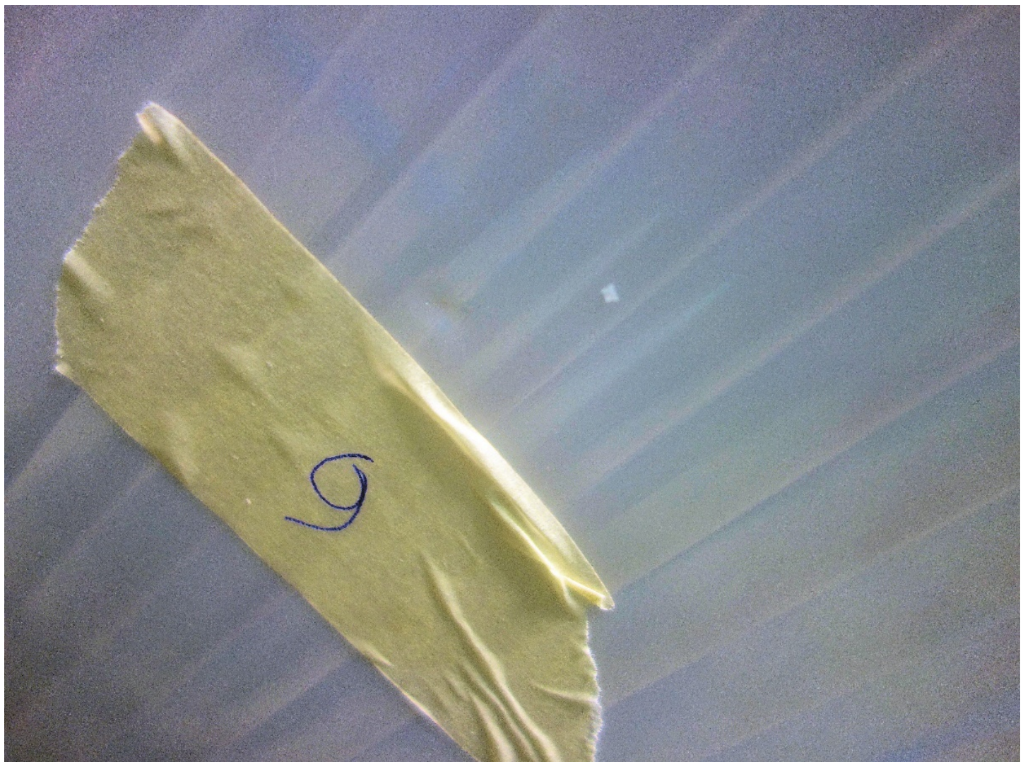
Detail of the damage caused to a sheet