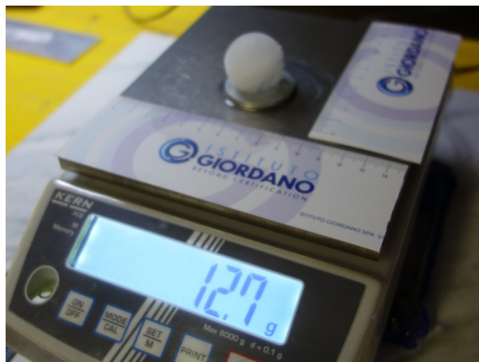
Photograph of an ice sphere